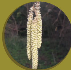
Catkins (flowers) found on a Hazel Tree