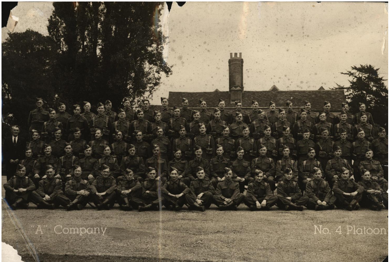
This photo shows the No.4 Platoon of the 32nd Middlesex Battalion Home Guard in front of the Manor House in 1939.